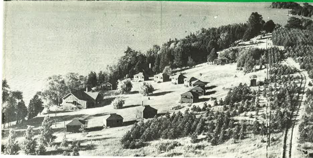
AREIAL VIEW OF NORTH CAMP

THE CAMPS COMPRISE A TOTAL OF 300 ACRES OWNED BY THE TORONTO HOME MISSION COUNCIL OF THE UNITED CHURCH OF CANADA