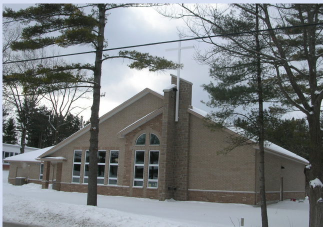
Council's Investing in Ministry Fund has financed the construction of the new Wasaga Beach United Church. The church held its dedication service on June 14, 2015.

In 2015, fifteen Investing in Ministry Fund loans are active, making church-building activities possible in fifteen congregations and church corporations.